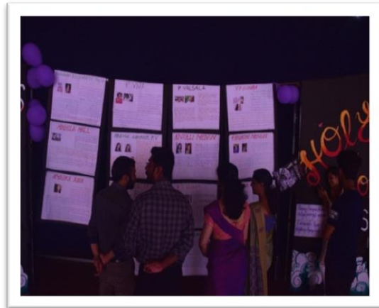
Poster Exhibition on International Women's Day on 08.03.2019