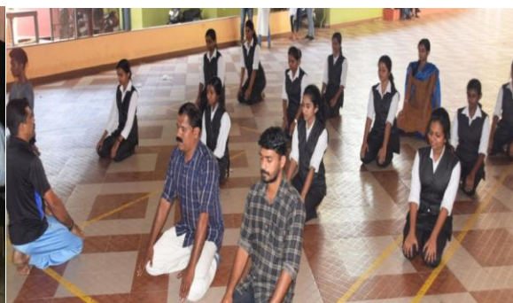
Self Defense Training programme (25.01.2019) for Students